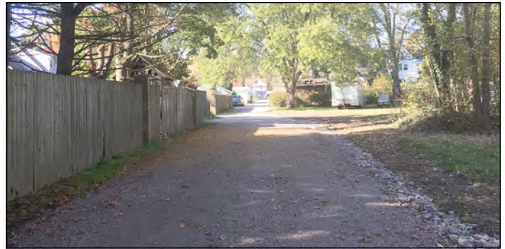
BERRY ALLEY READY FOR FUTURE PAVING

entrance to the St. John's Lutheran Cemetery.