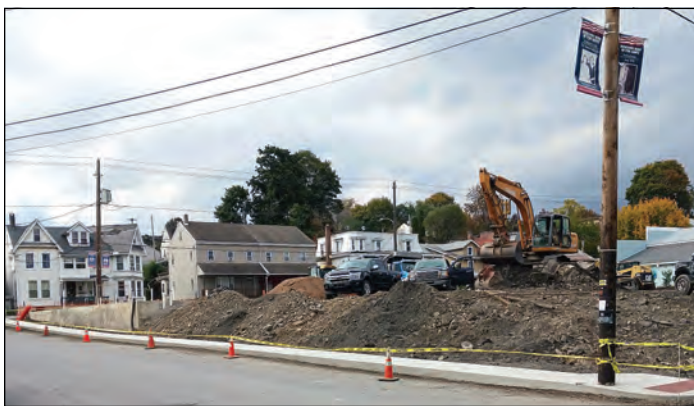
PROGRESS AT FORMER RED ARROW SITE

Now for some good news. As of this printing, you will notice a new doctors' suite on the sight of the former Red Arrow gas station. It's architecture will brighten the center of town. There is also additional space left for a future urgent care facility if we can