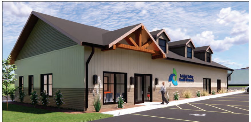
PROPOSED LVHN FAMILY MEDICAL FACILITY

rising costs of everything the Borough purchases has been hit as a result of inflation. The Borough will work vigorously to hold the line on any increase.