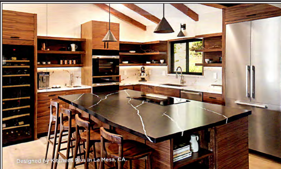
Designed by Kitchens Plus in La Mesa, CA.

Keep an eye out for more information on how to join, support, and follow the Pool Pals online. It's another great way to stay involved and make a splash in our community!